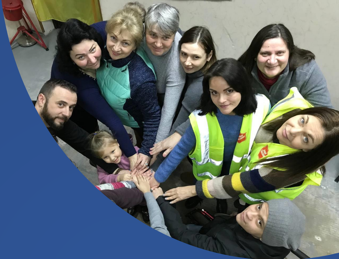
On the Photo: Dnipro Corps Leaders and volunteers, Ukraine Division.